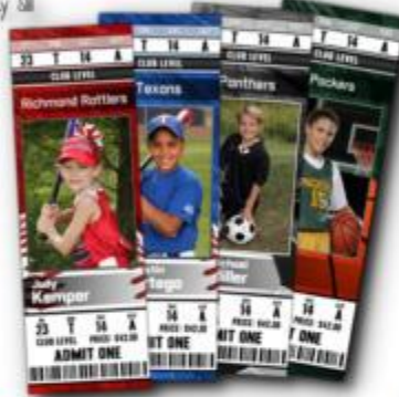
Game Day Tickets