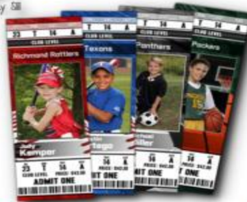
Game Day Tickets